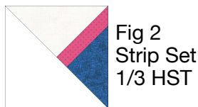
Fig 2 Strip Set 1/3 HST