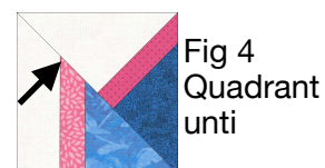
Fig 4 Quadrant unit

Fig 4: Take the medium color HSTs and sew them to the dark color HSTs, repeat to make 3 more units. Press in direction of arrow