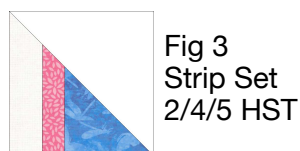
Fig 3 Strip Set 2/4/5 HST