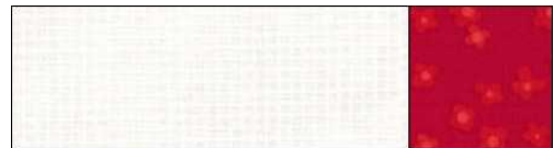
Fig B Make 1-Press to Fabric A