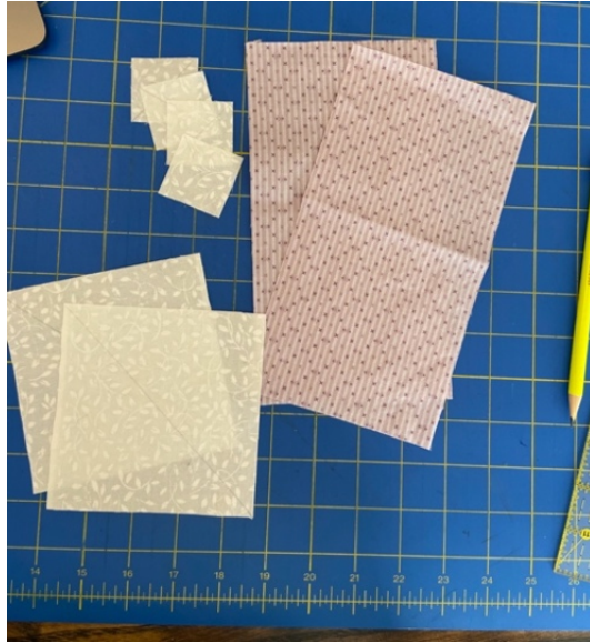
FIGURE 2 - CUT PIECES