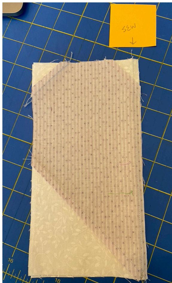
FIGURE 5 - SEW THE HEART DOWN THE MIDDLE AS SHOWN