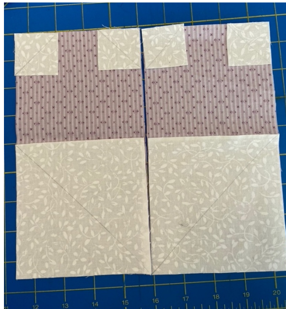
FIGURE 3 - PLACEMENT OF PIECES