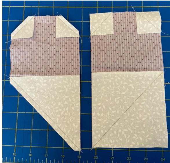
FIGURE 4 - SEW AND TRIM LIKE THIS