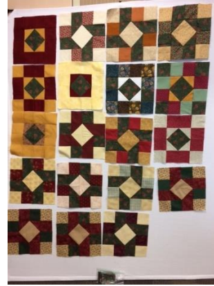
March completed BOMs