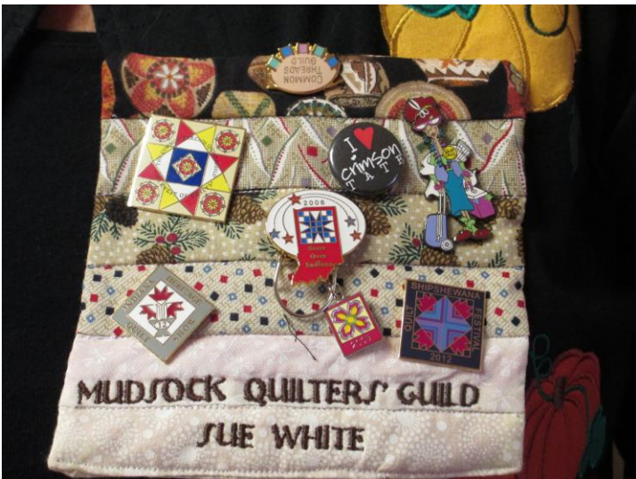
Don't forget to wear your nametag!