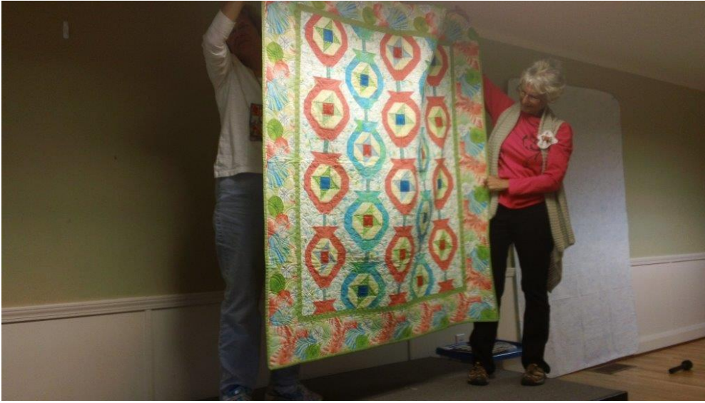
Two of Claudia's beautiful Quilts!