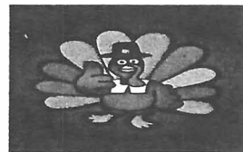
Tom Turkey gives us a "Thumbs Up"!!