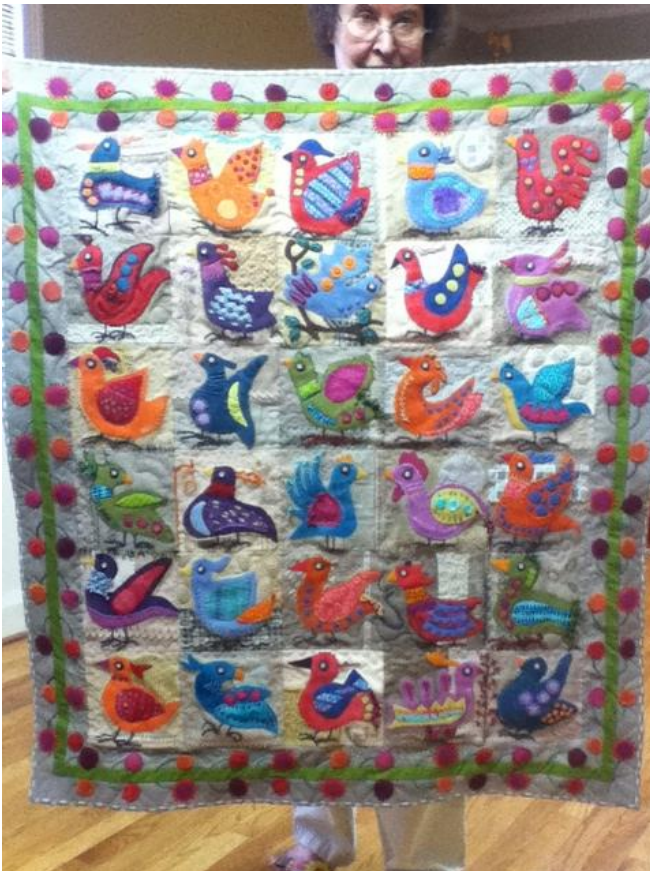
Elizabeth Meeks' latest creation

Remember to wear your name tag to every guild meeting!