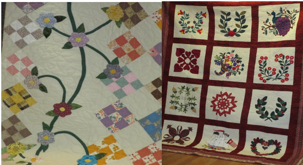
Susie Wetzel's quilt