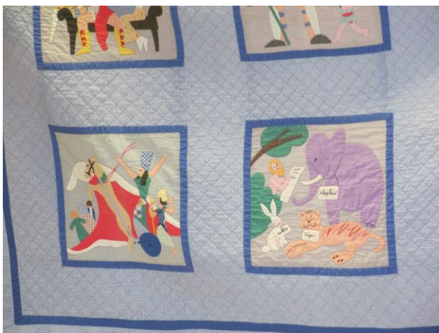
Details from the Bible Quilt