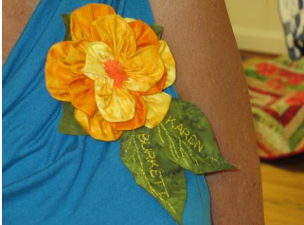
Wear your nametag!