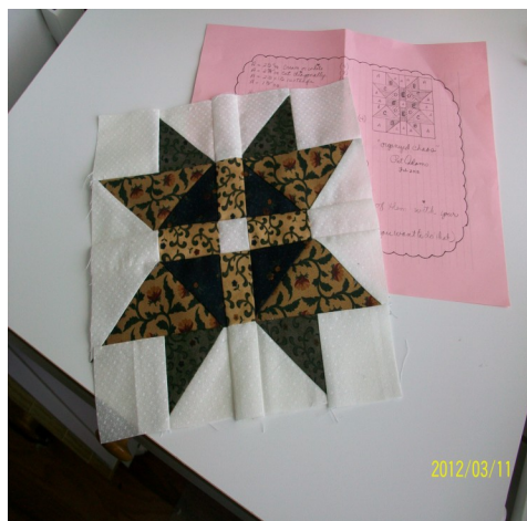
February 2012 Block of tattern Pat Adams -