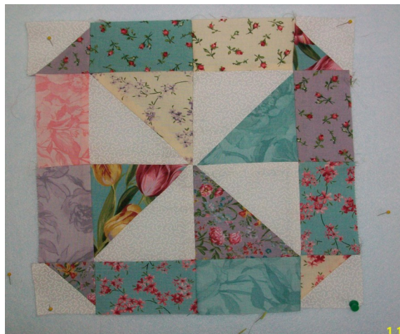
January 2012 Block of Month Swap Pattern Rosie Antonides—Progress—at the Long Arm