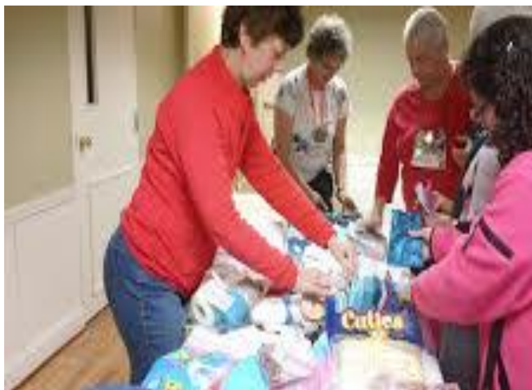
Getting ready for the Tag Sale

Our big event is almost here; Saturday, May 14, 2016 from 7:30 a.m. to 3:00 p.m. We will open the sale from 9:00 a.m. to 2:00 p.m. and again will need lots of volunteers. Our May 9th meeting will be the last opportunity to bring in donated items. We will be staying after the meeting to go through all donated items and get ready for the sale. Volunteers are needed. Check out our article in the "Current" April 30th issue.