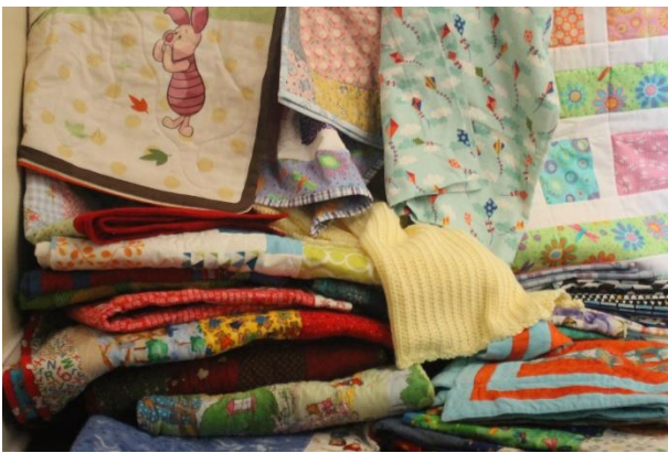
Riley Quilts 2016