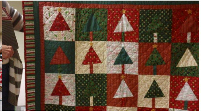
Christmas tree throw