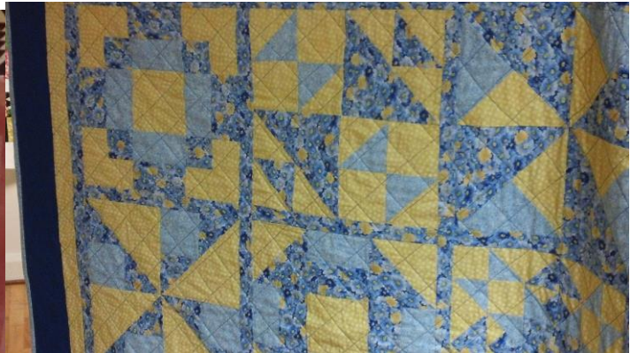
Great results from a year of learning in the Quilting 101 class