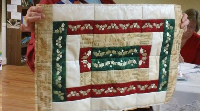
Lovely table runners in the Christmas spirit