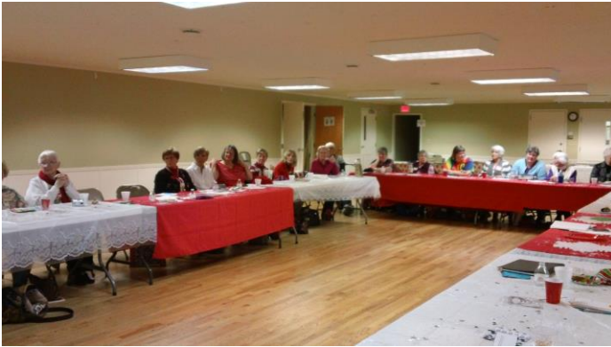
December Pitch-in luncheon